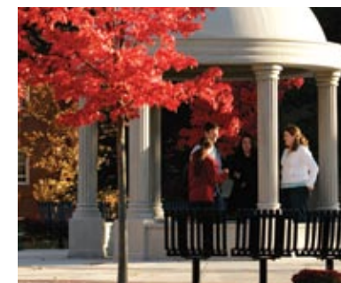
Transylvania University students gather at Haupt Plaza.

The university's emphasis on research is expanding its influence; the Coldstream Research Campus links small businesses with university resources.