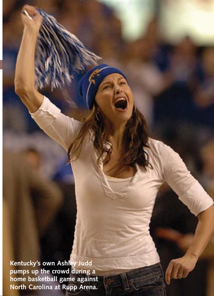
Kentucky's own Ashley Judd pumps up the crowd during a home basketball game against North Carolina at Rupp Arena.

cont'd from page 129 arts school since 1819, almost 85 percent of the students study abroad during their college career. The Danville school hosted the 2000 vice presidential debate.