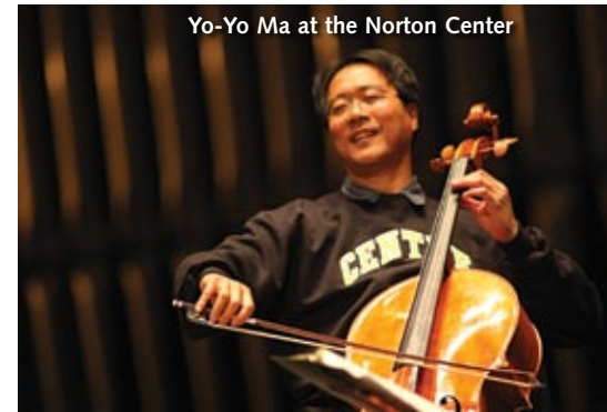
Yo-Yo Ma at the Norton Center

The home of collections in photography and art ranging from Old Masters to abstract expressionists,