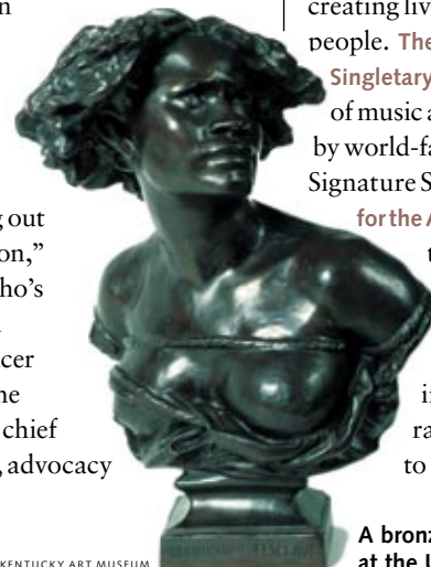
A bronze bust by French sculptor Carpeux at the University of Kentucky Art Museum.