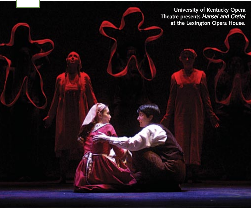
University of Kentucky Opera Theatre presents Hansel and Gretel at the Lexington Opera House.