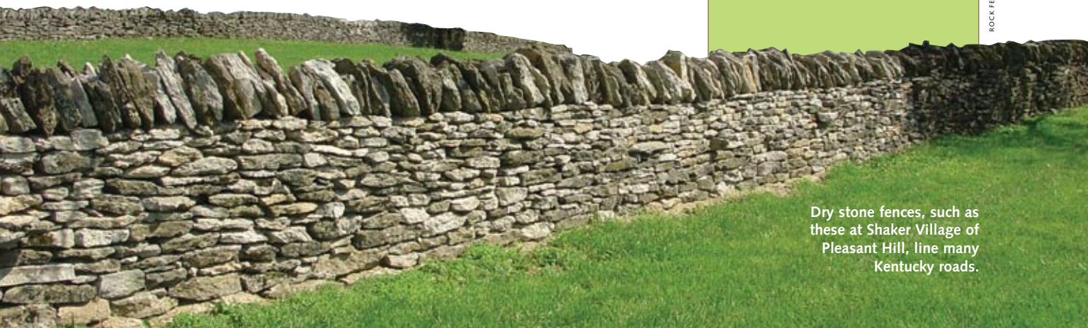
Dry stone fences, such as these at Shaker Village of Pleasant Hill, line many Kentucky roads.

"It's a craft," he says. "And keeping it alive is important."